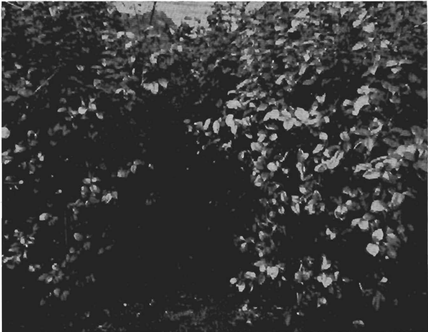
The healthy appearance of the 'Debutante' plants and the many blooms produced every year are compelling evidence that the application of gibberellic acid has not hurt the plants in any way.

They fertilize in their watering system, using a formula that is set on the basis of leaf tests. The fertilizing period coincides with their watering period.