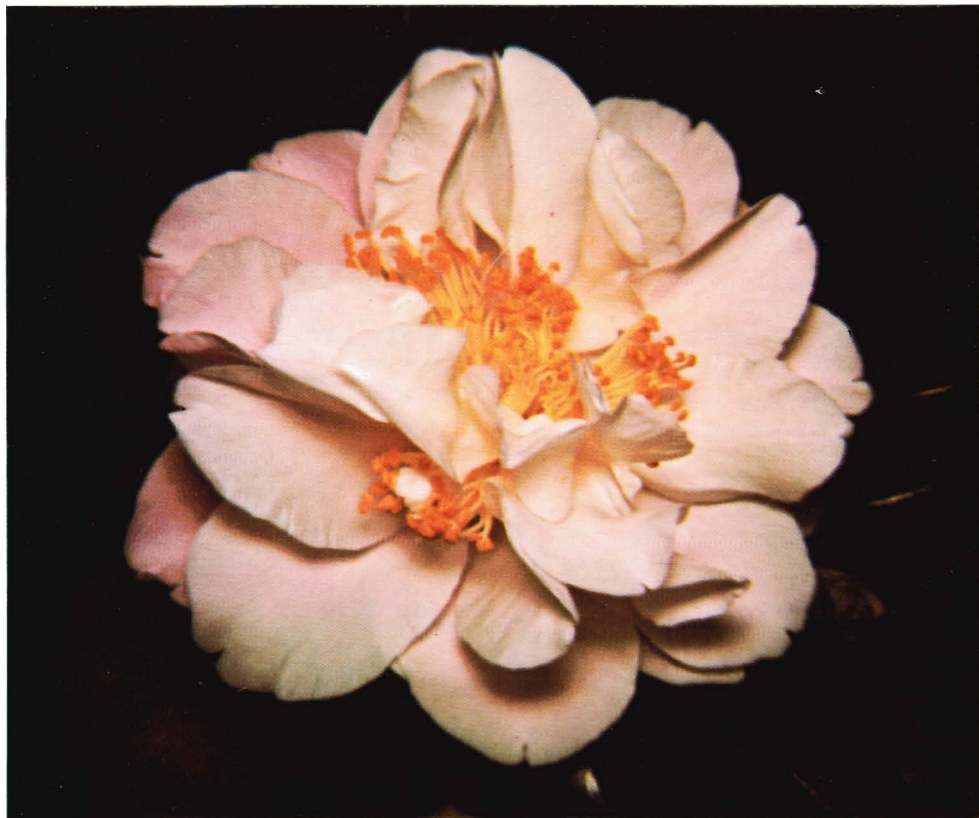
'Morgan Whitney'

A Publication of the Southern California Camellia Society